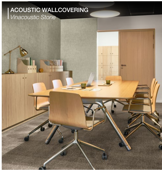
ACOUSTIC WALLCOVERING Vinacoustic Stone