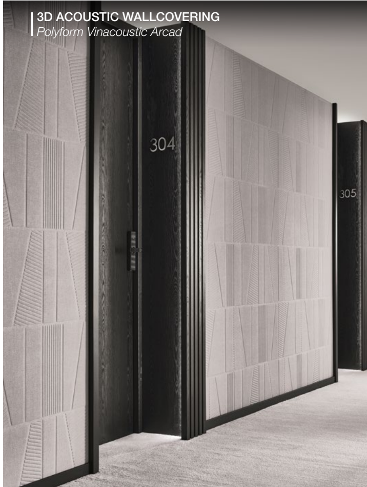
3D ACOUSTIC WALLCOVERING Polyform Vinacoustic Arcad