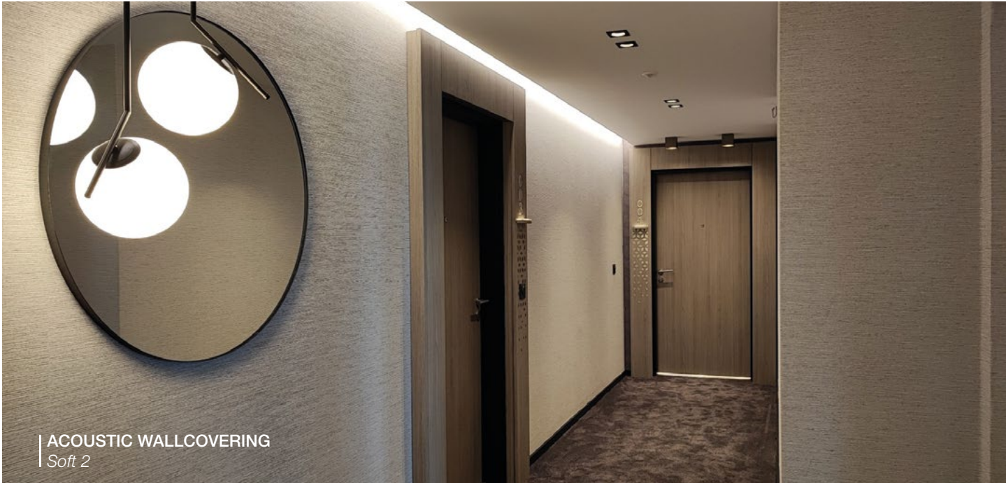
ACOUSTIC WALLCOVERING Soft 2