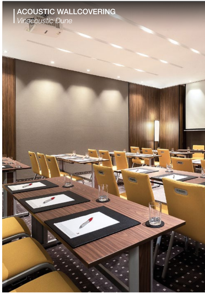
ACOUSTIC WALLCOVERING Vinacoustic Dune