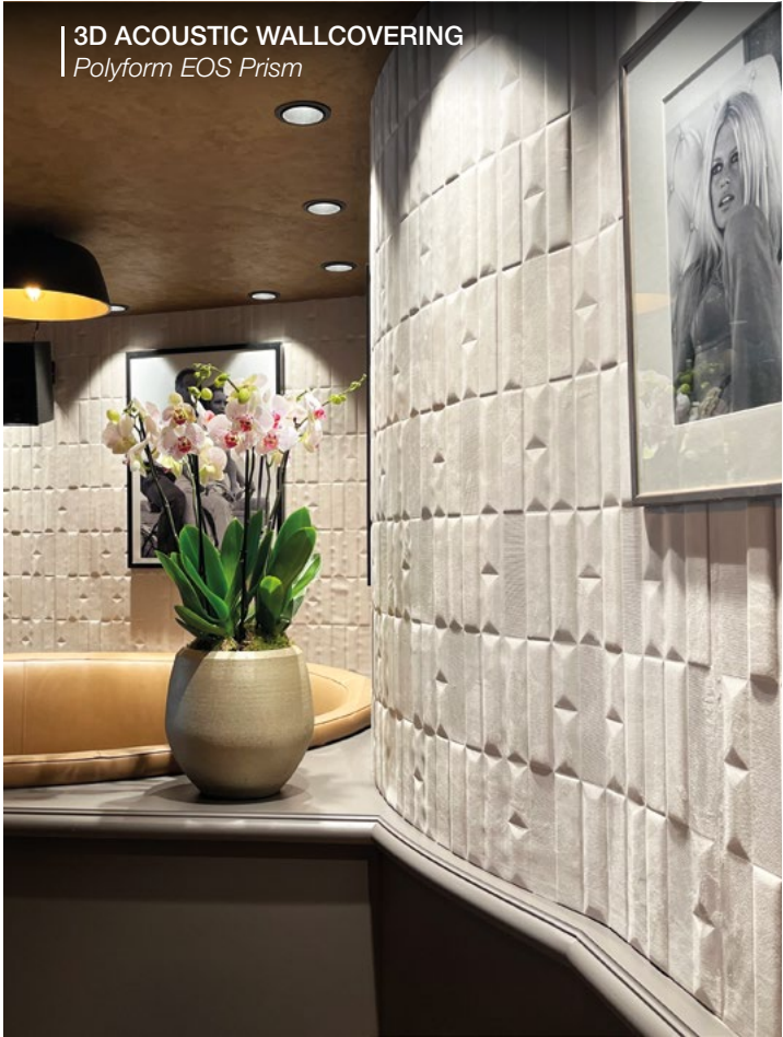
3D ACOUSTIC WALLCOVERING Polyform EOS Prism