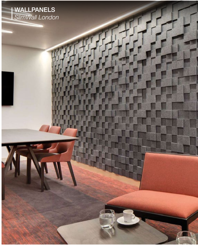
WALLPANELS SlimWall London