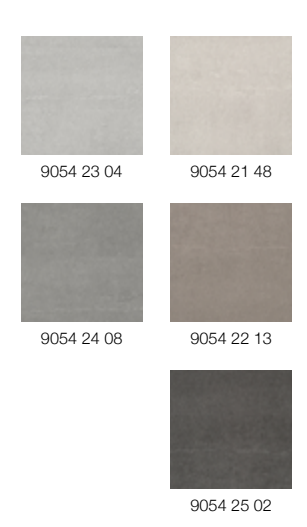
Micro-perforated vinyl on felt-lined acoustic backing Width: 130 cm ± 2 cm Easy to look after and hygienic Acoustic comfort: aw 0.25 - NRC 0.25