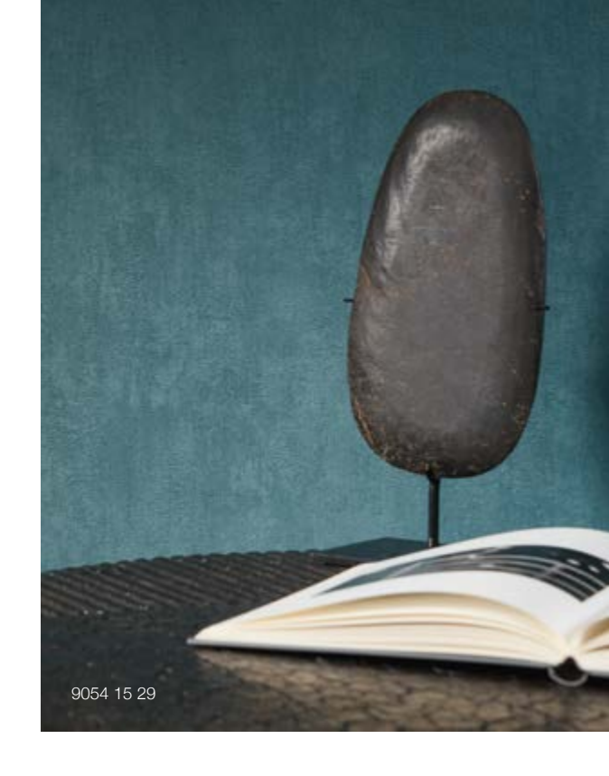
Micro-perforated vinyl on felt-lined acoustic backing Width: 130 cm ± 2 cm Easy to look after and hygienic Acoustic comfort: aw 0.25 - NRC 0.25

A decor inspired by concrete, like a raw mineral, minimal and architectural. A claim for minimalist aesthetics, contemporary as much as authentic. This covering has an extremely matte finish and a deep texture, making it highly realistic and adding relief to your walls. A three-tone printing process enhances the feeling of depth.