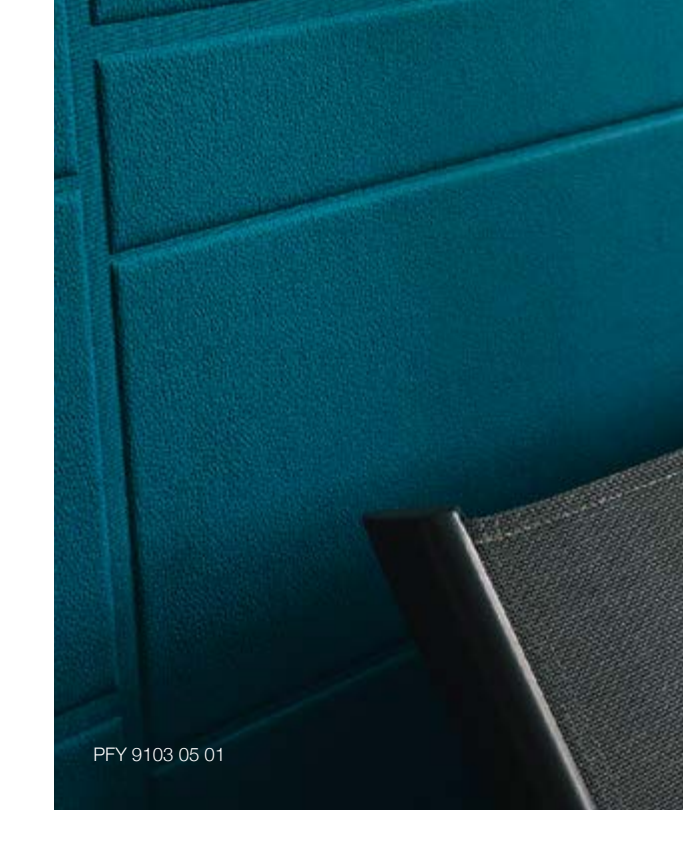
Micro-perforated vinyl on felt-lined acoustic backing Width: 125 cm ± 2 cm Easy to look after and hygienic Acoustic comfort: aw 0.25 - NRC 0.25

This moulding process reinvents wall surfaces to bring out shapes and patterns which were exclusive to furnishings, until now. Designed to look like panels, PANEL adds graphics and structure to any environment. The various combinations show the opulence side of this XXL pattern. Adding caharacter and view volume