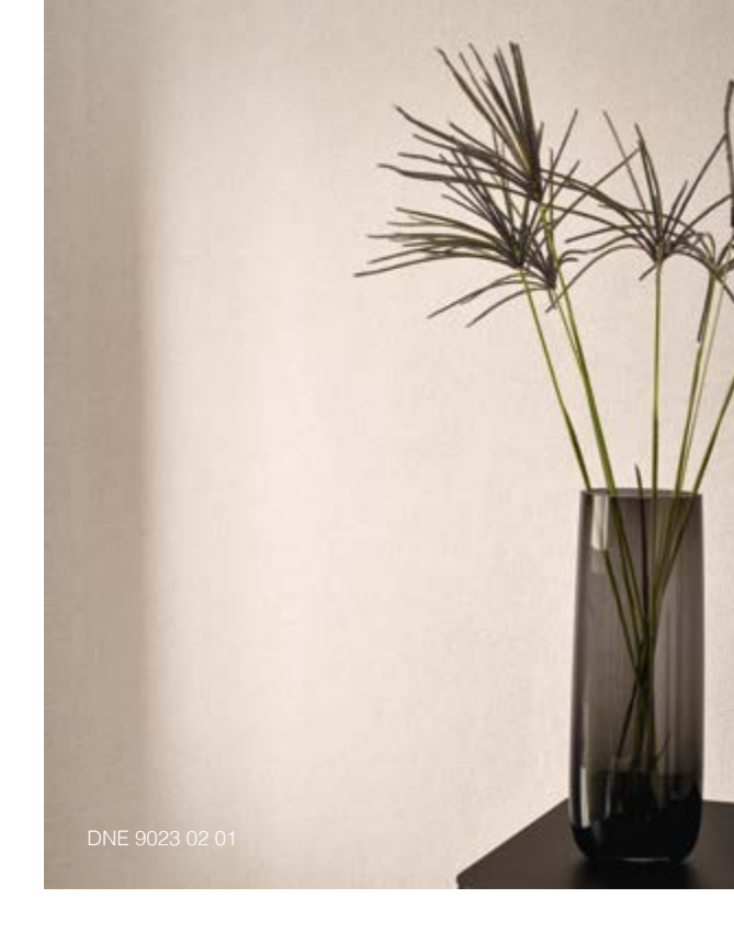
Micro-perforated vinyl on felt-lined acoustic backing Width: 130 cm ± 2 cm Easy to look after and hygienic Acoustic comfort: aw 0.25 - NRC 0.25

A full grain leather effect, a noble and timeless material as an acoustic and decorative solution. This authentic and timeless decor will adorn your walls with its sober and precious character, creating an enveloping, warm and elegant atmosphere.